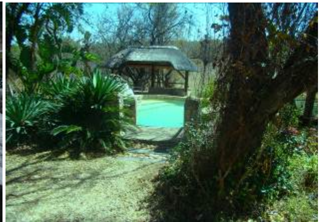
Pool and Pool Thatched entertainment area