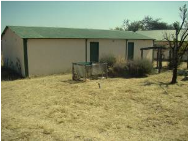
Peach Packing Shed and Store