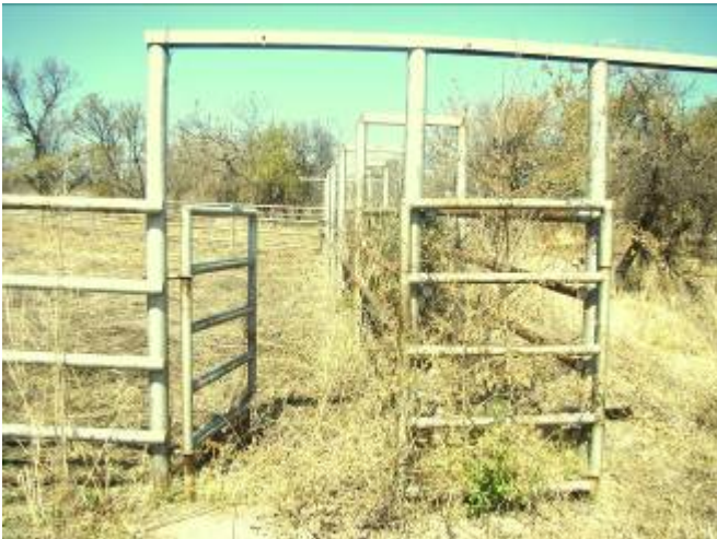
Steel Cattle Kraal