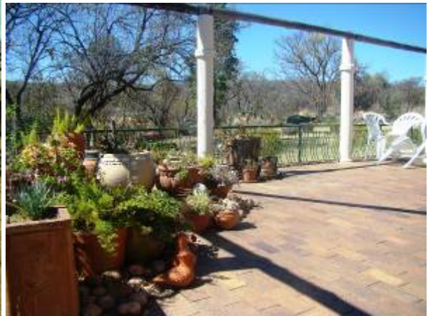
Gardens from Patio