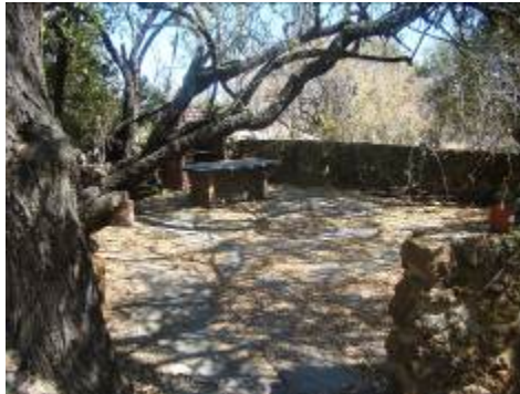
Lapa and Braai area