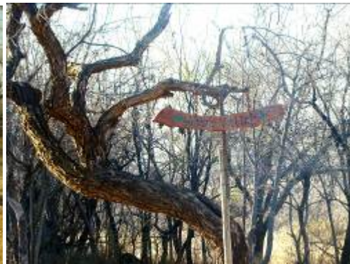
Green Valley Sign