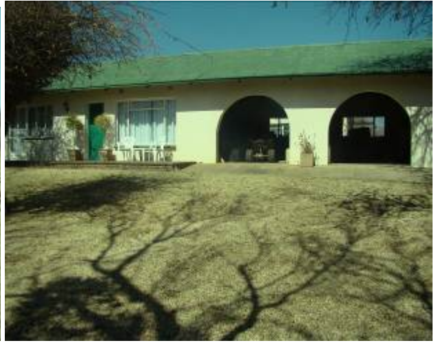
Naartjie Cottage, Study and Garages