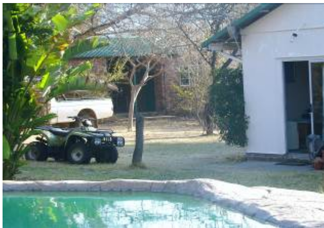
2 nd house with Offices in background