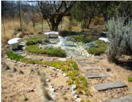
Herb Garden by river